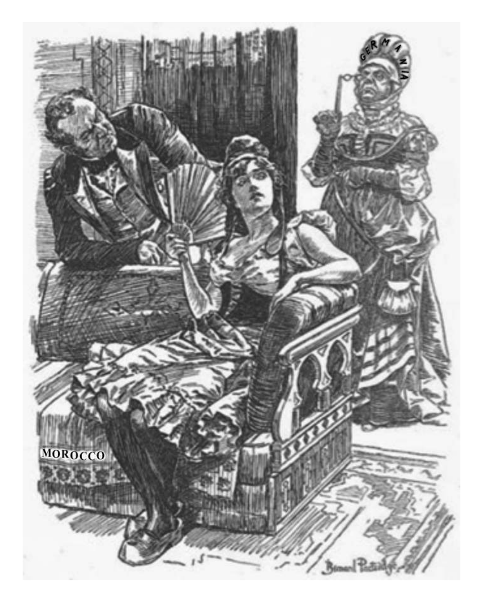
A British cartoon published in April 1905. Its title is 'The Matchmaker, despite herself.' The French woman sitting says to Britain, 'If she's going to glare at us like that, it almost looks as if we might have to be properly engaged.'