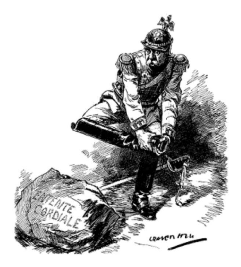
A British cartoon, entitled 'Solid', published in August 1911. The Kaiser is saying 'Donnerwetter! It's rock. I thought it was going to be paper.'